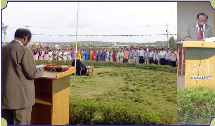
Udyanagiri Campus, Bagalkot