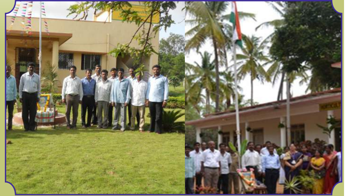
HREC, Hidkal Dam